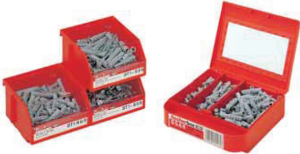
Stacking box ST