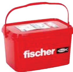
S in bucket